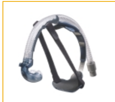
Breeze SleepGear With DreamSeal Assembly