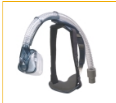
Breeze SleepGear With Nasal Pillows Assembly